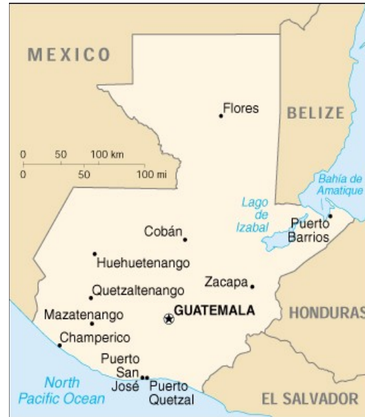
Map of Guatemala with the bigger cities.